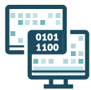
Multiple Application Analysis