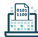
Eclipse GUI or CI Workflow Integration